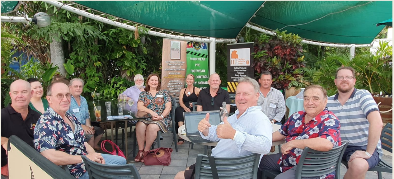
The AGM in full swing